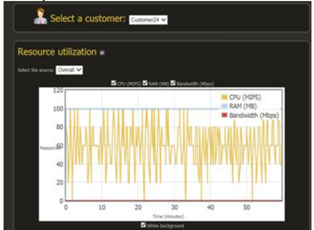
Fig. 2: resource utilization by a user

8.1 Client Computation Cost in terms of above mentioned metrics: Consider two customers (Customer24 and Coustomer1) with 5 and 6 virtual machines (VM) for each user. The fig. 2 shows the resource utilization of all the VMs for Customer24. And the fig. 3 shows the execution time of the user Customer24 in the cloud. This shows that we can securely store the data in the cloud.