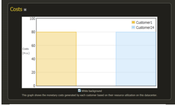
Fig. 6: Monetary costs of the user's utilization of resource on the cloud.