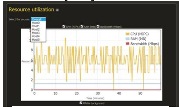
Fig. 4: resource utilization at the cloud by users.

8.2 Cloud Computation Cost: To evaluate the performance of cloud in our proposed system, we test its cost to respond to the client operation which includes file sharing, storing.